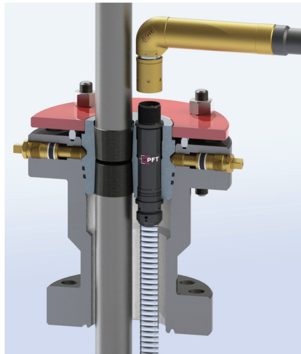
*Covered by U.S. and foreign patents